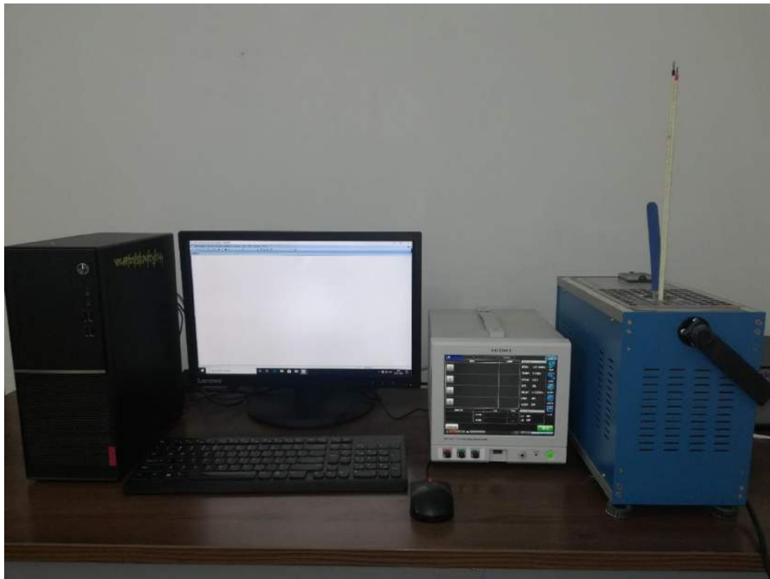
High Frequency Impedance Analyser