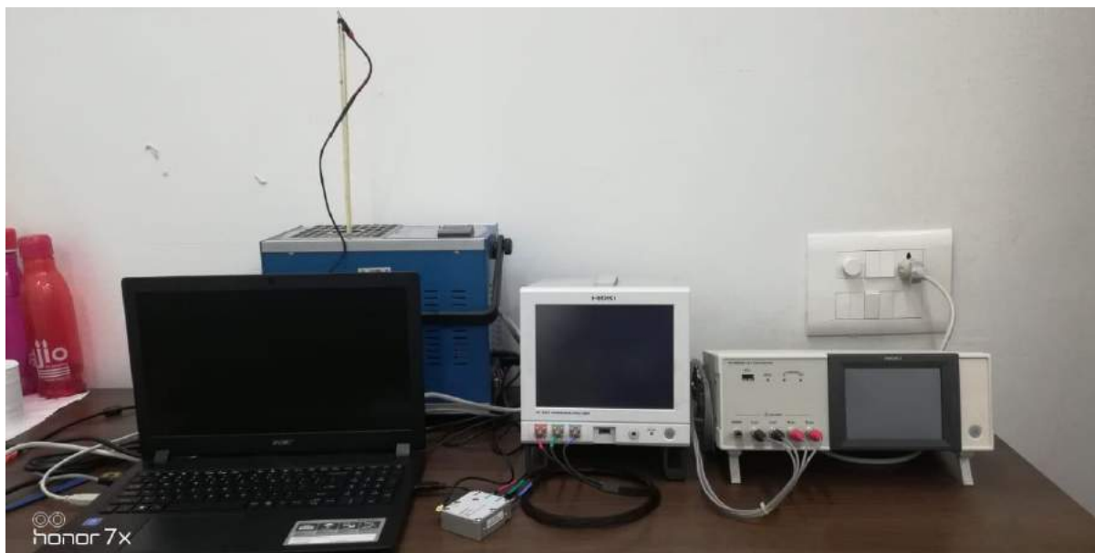
LCR Meter Low Frequency