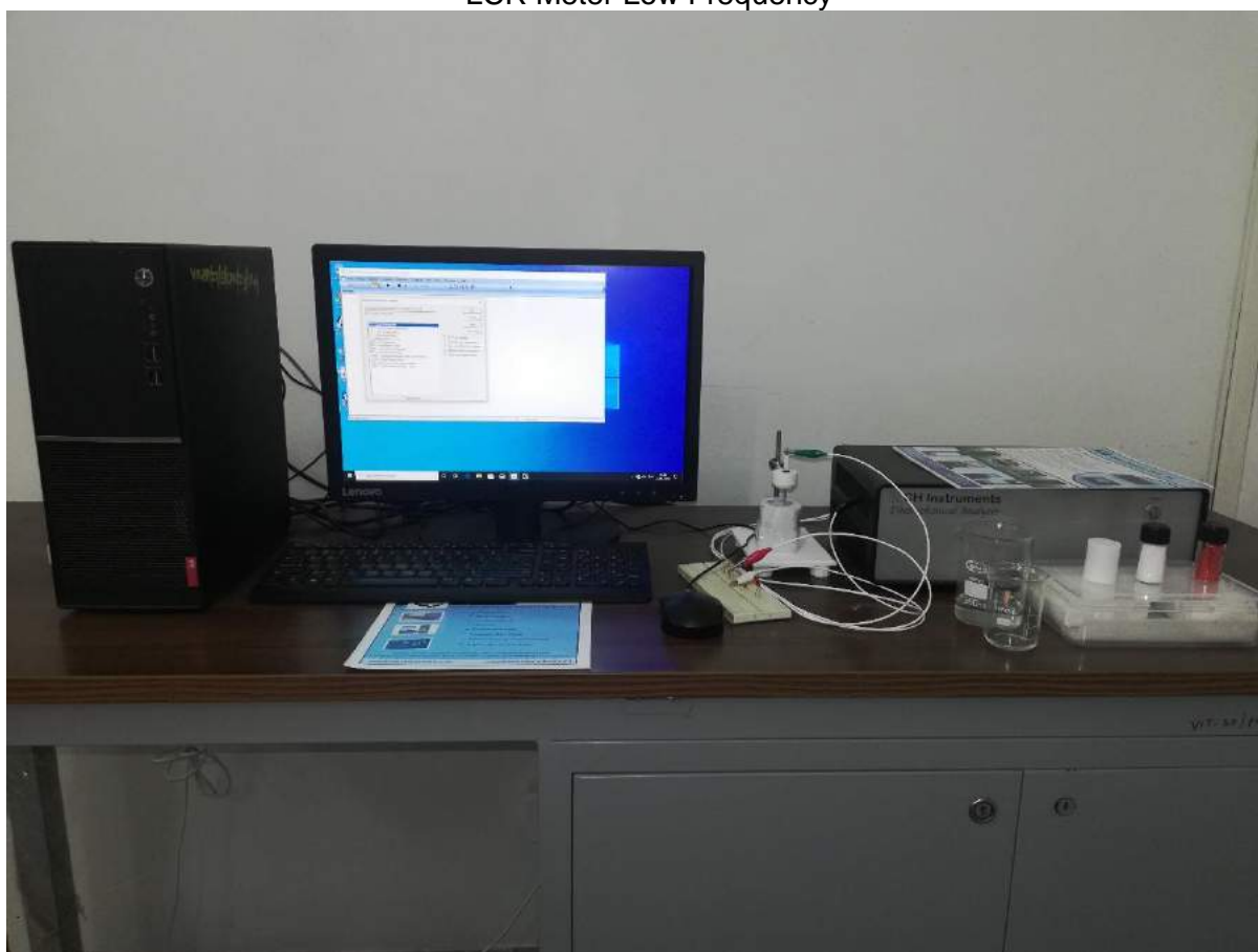
Electro Chemical Workstation