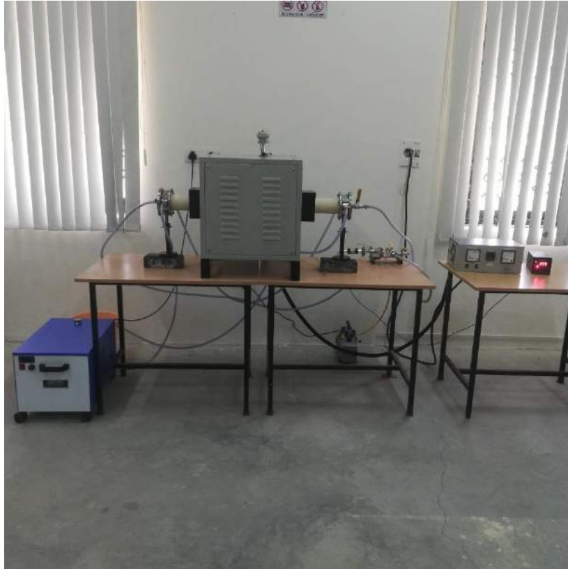
High Temperature Vacuum Furnace